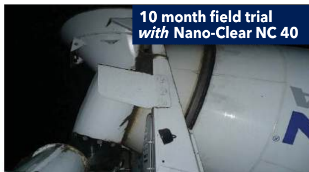
Even sticky concrete dust releases easily from Nano-Clear NC 40